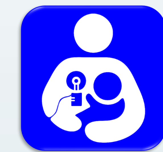
The Universal Breastfeeding symbol depicts both nursing and the breast pump, which is recognized as being the most common form of milk expression (Universal Breastfeeding Symbol, n.d.).

The best practices presented within this poster can serve as a guidance mechanism for emergency managers and related professionals, as they work to implement maternal and infant health-sensitive protocols and practices within their plans and operations. Simple activities, such as posting signage like The Universal Breastfeeding symbol (seen below), within shelter and congregate settings can have meaningful impacts, by helping to create a less stigmatized, and more comfortable environment for lactating families. However, this collection of identified best practices is not definitive, as emergency managers and related professionals must ceaselessly work to meet the needs of these vulnerable populations through supportive and relevant means, especially in regard to long-term recovery.