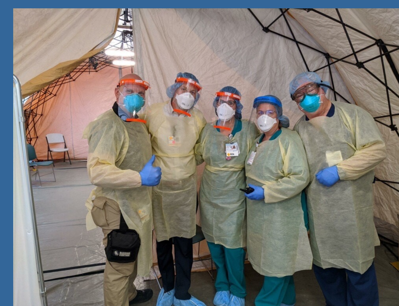
Sutter Roseville Hospital Staff 4/20