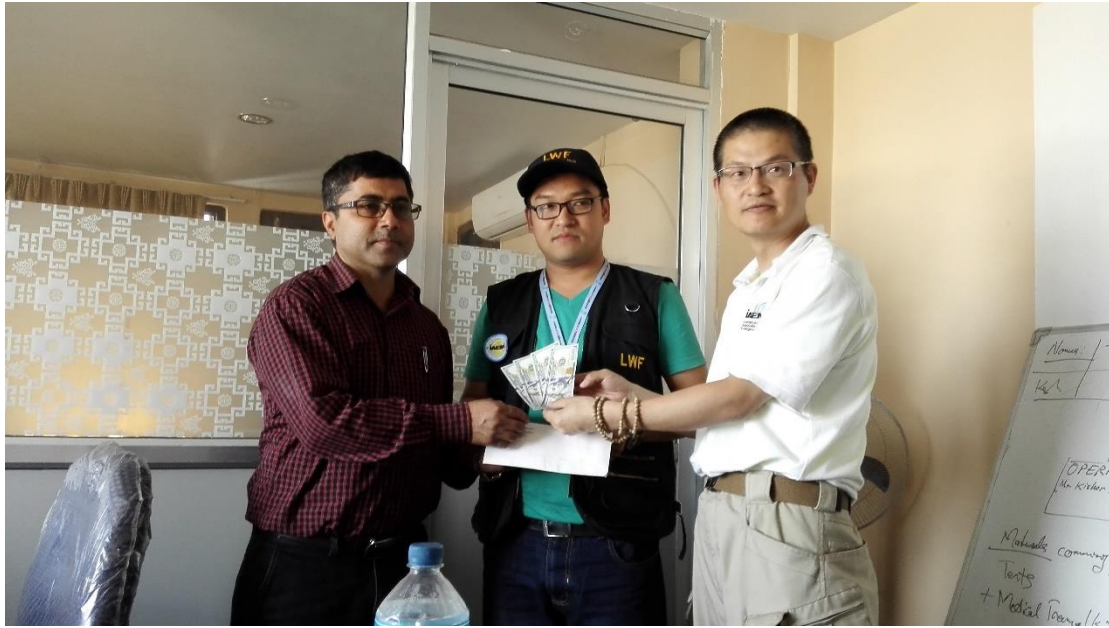
Figure 7 IAEM Asia donate USD cash to IAEM Nepal