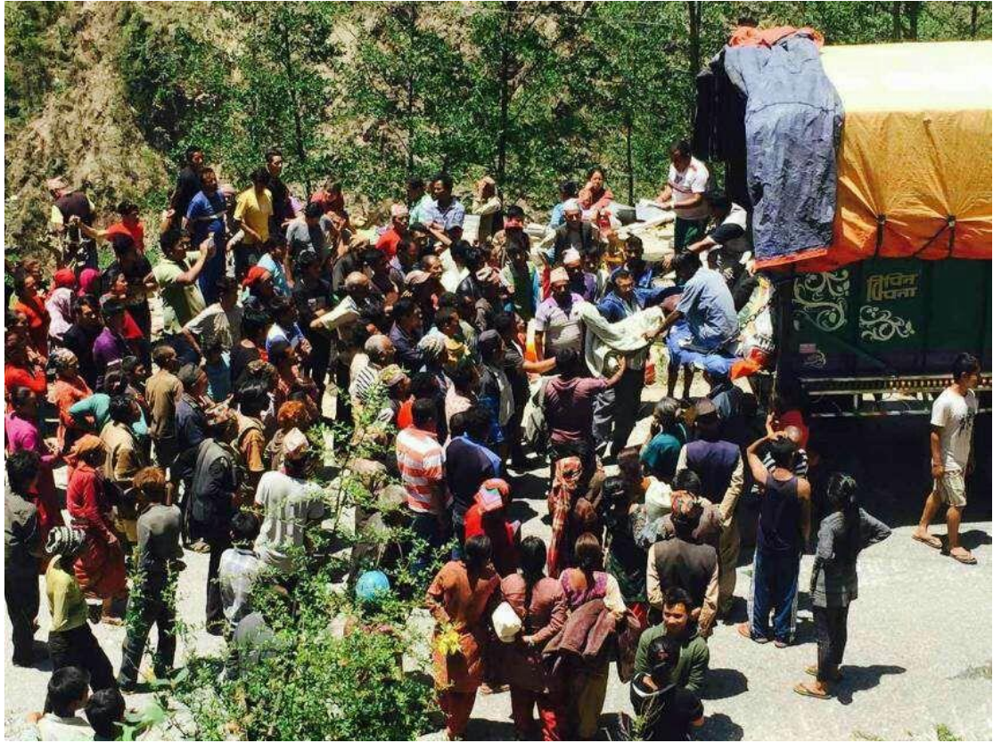
Figure 9 IAEM team deliver relief cargo to impacted village on 2 nd May, 2015