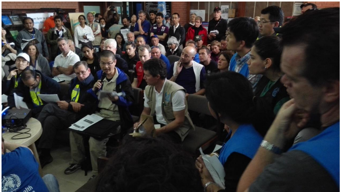
Figure 2 IAEM on UN Cluster meeting