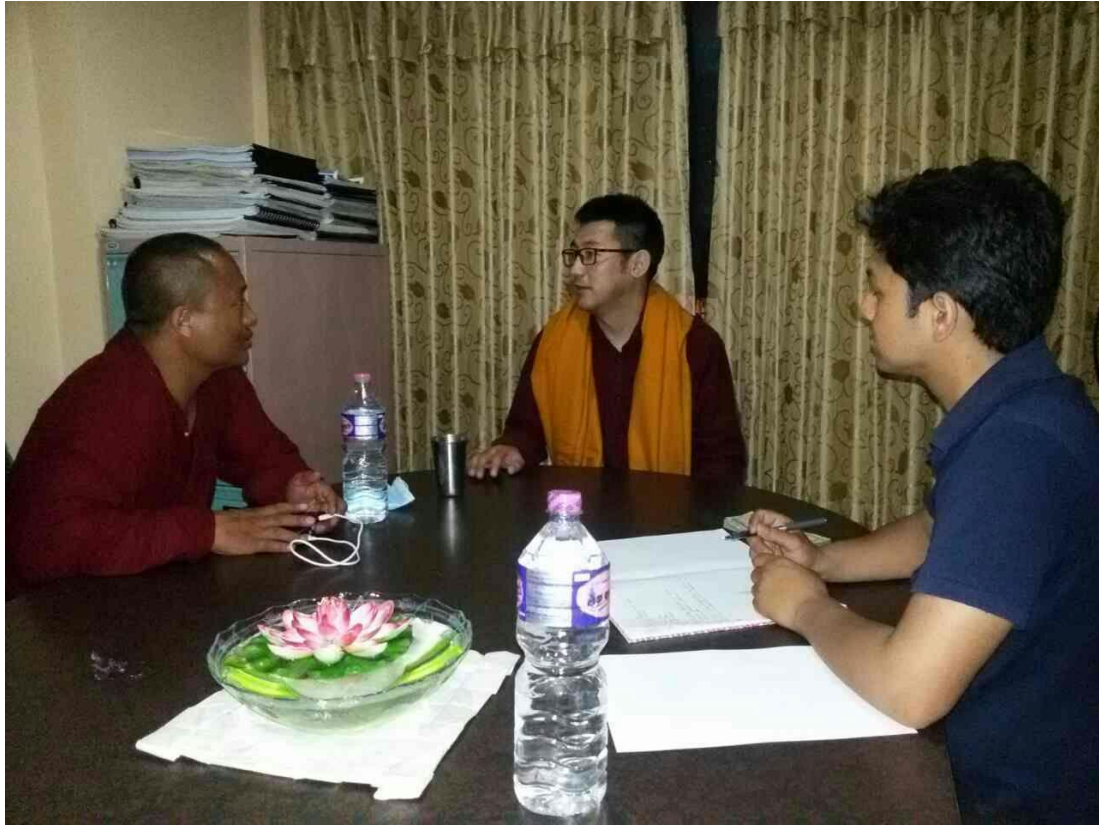
Figure 5 IAEM EOC head of logistic meeting with donators