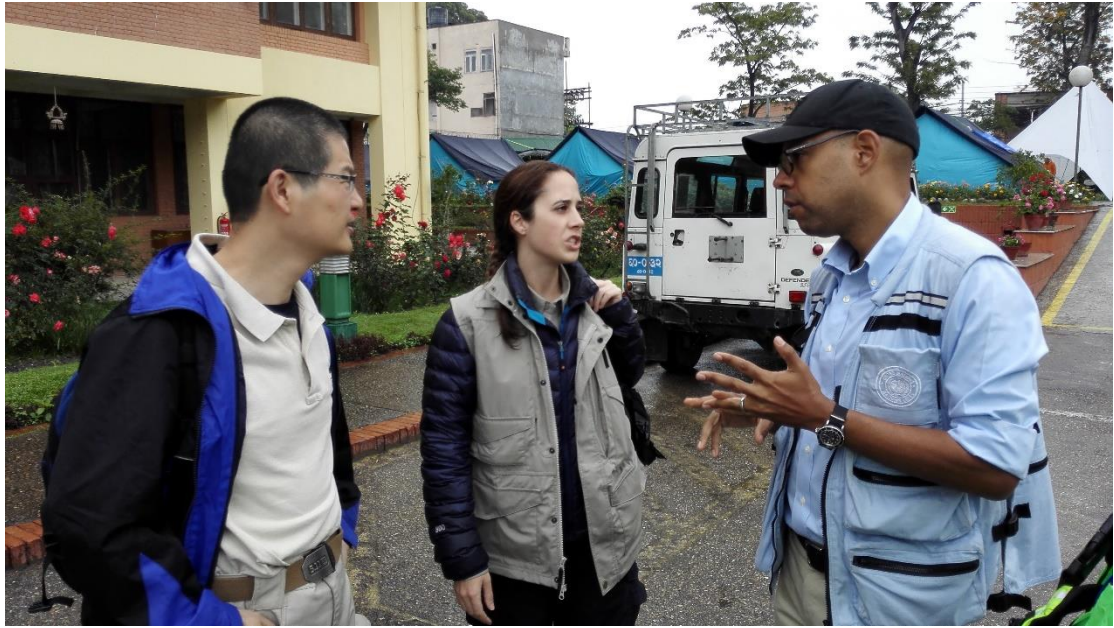
Figure 1 IAEM coordinate with UN