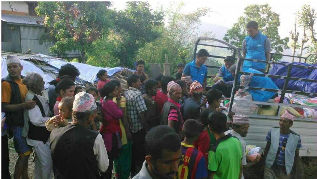
Figure 8 IAEM team deliver relief cargo to impacted village on 4 th May, 2015