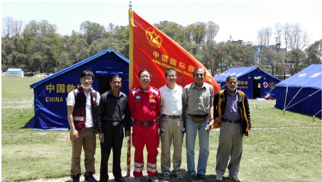
Figure 4 IAEM Coordination meeting with NCDM and CISAR