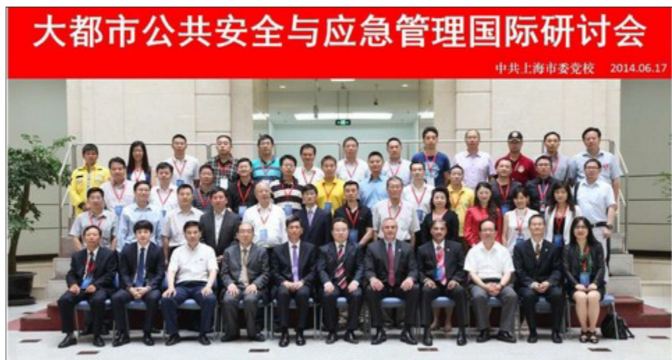
Attendees at the IAEM-Asia Annual Meeting, June 17, 2014, Shanghai, China.