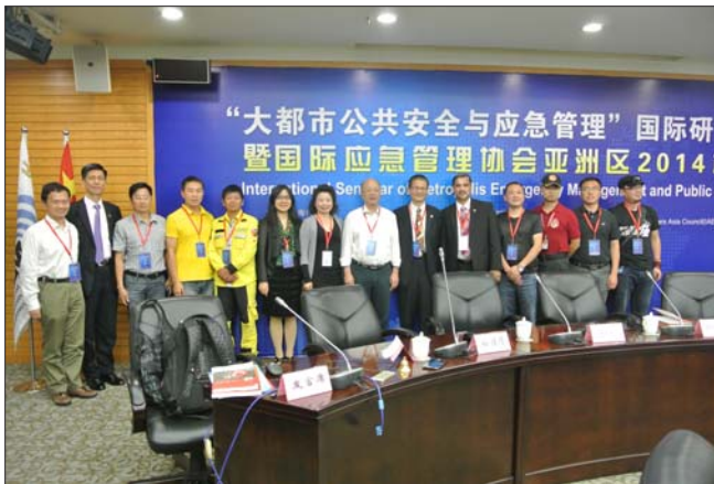
Pictured here are some of the IAEM-Asia Council members who attended the Annual Meeting.