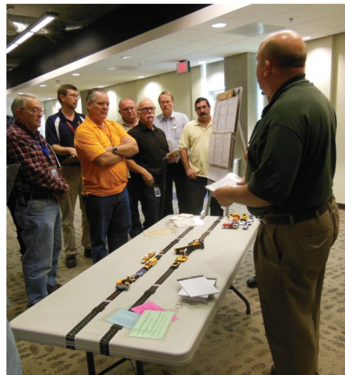
In person class with sand table exercise.