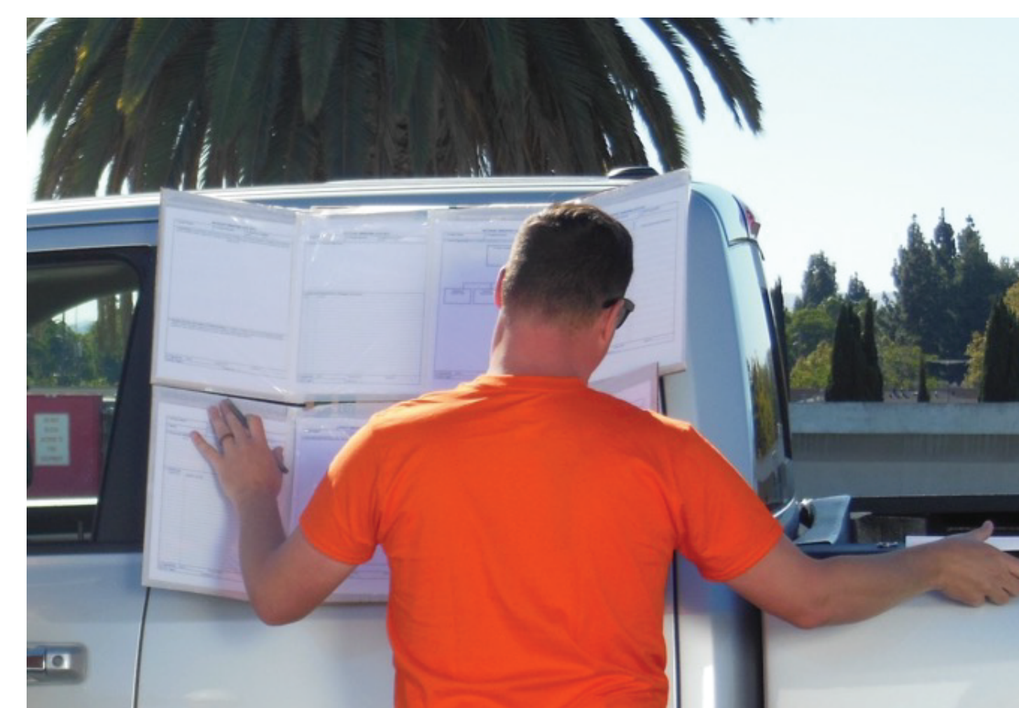
Supervisor placing folder on the side of a work truck.