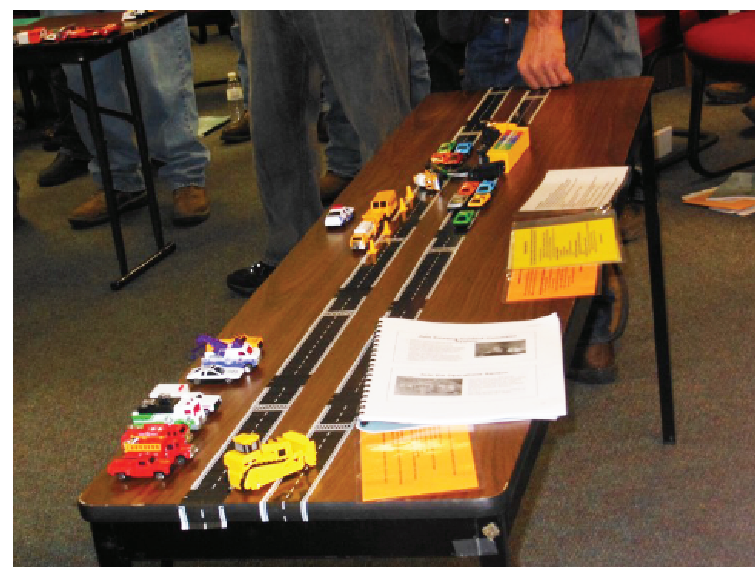
Sand table exercise with cars and equipment to simulate car accident and DOT response.