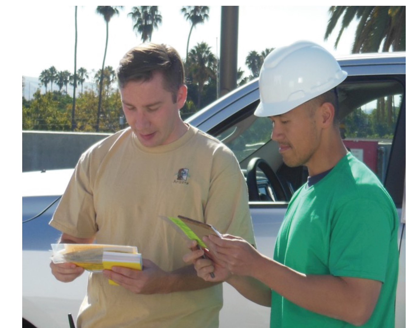
DOT Incident Commander and Logistics Chief review position checklist cards.