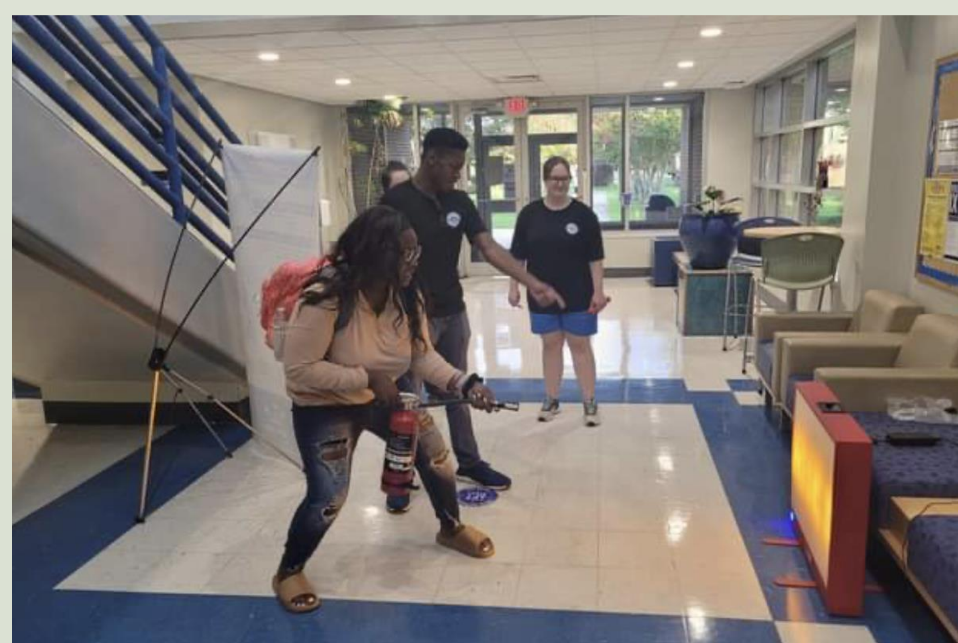
The CERT team frequently conducts outreach missions that teach the community to be better prepared for disasters.