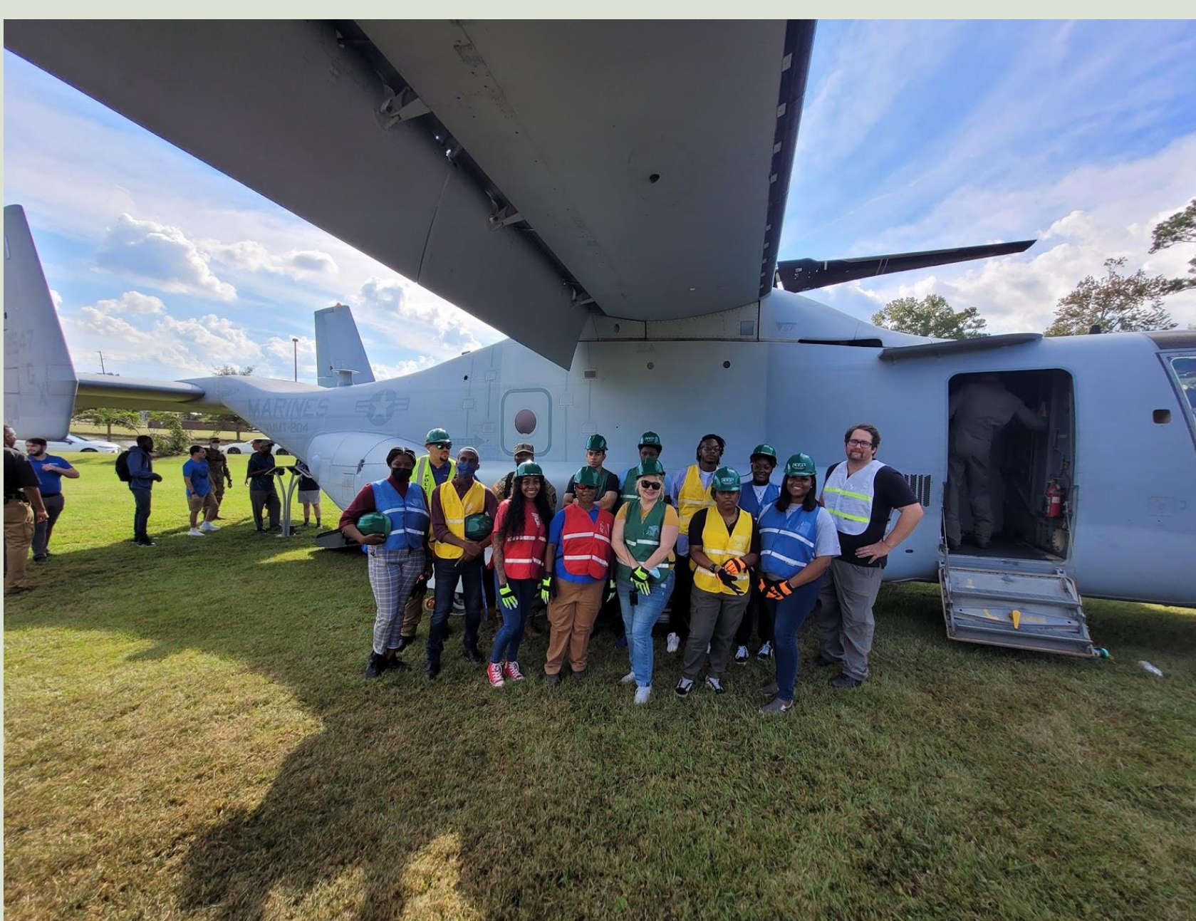
Elizabeth City CERT was the first university team to land, and practice loading/unloading an Osprey on campus.