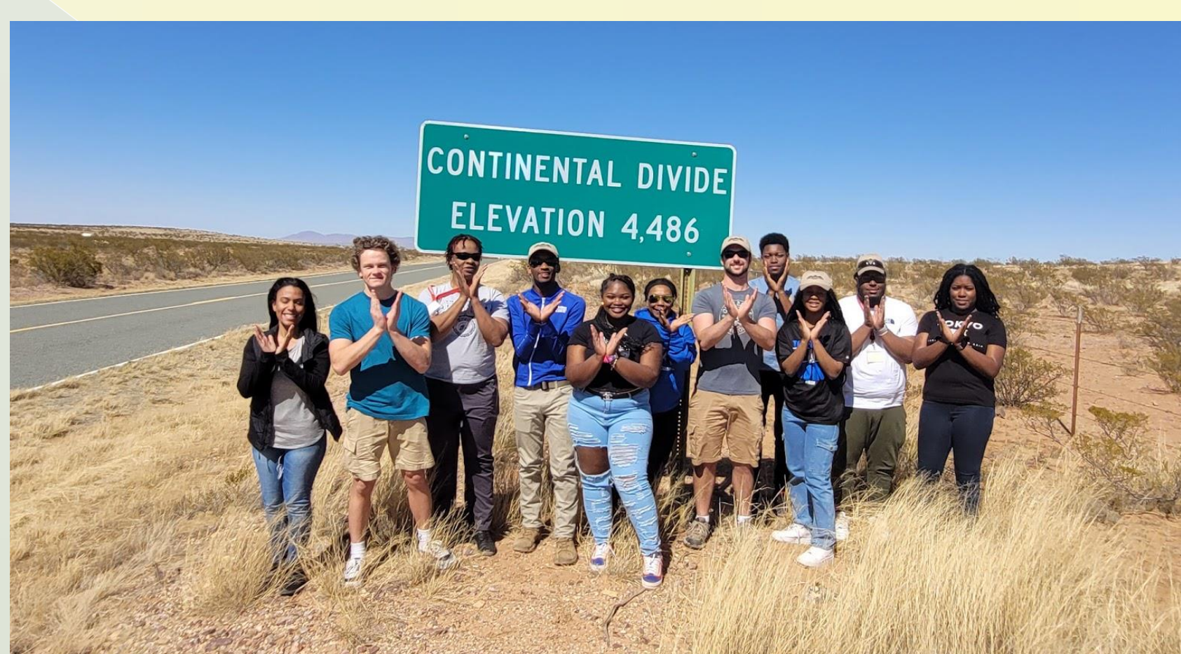
Our CERT attended training courses with New Mexico Tech, learning about counter UAS technology and skills.