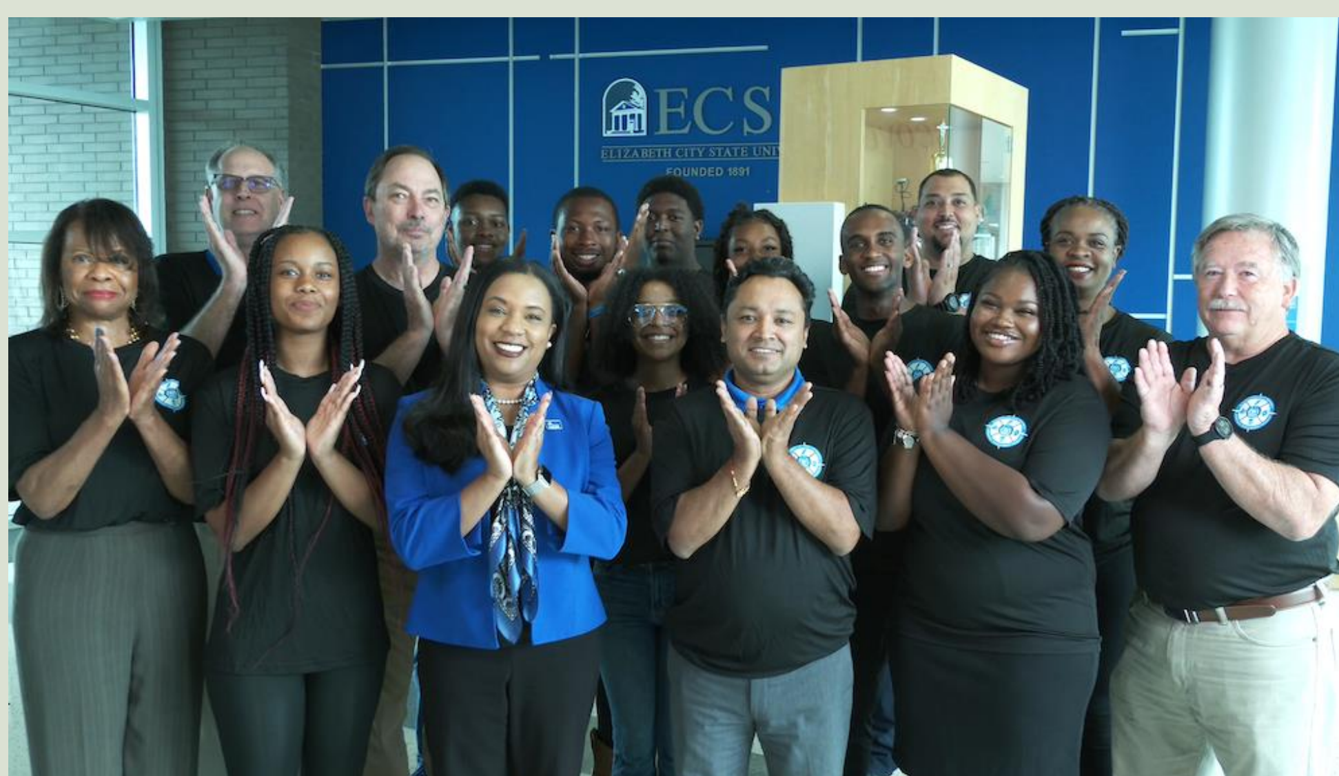
The ECSU CERT team has been awarded the National Cert Association Innovation Award for their combined efforts.