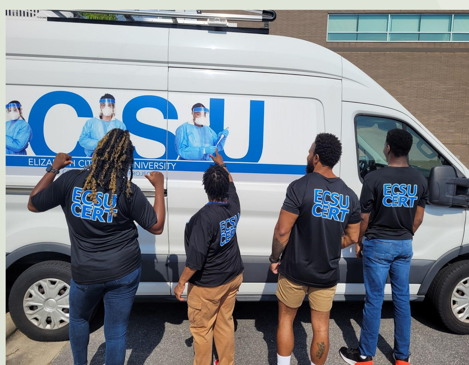
ECSU CERT members showing off their shirts.

Colleges and Universities often talk about their commitment to their community, but many overlook the important role that students can play in helping with the prevention, preparedness, response and recovery efforts for emergencies and disasters not only on their own campus but in their community. Higher education institutions do not consider the impact that they can make in community safety simply by encouraging the inclusion of emergency and disaster related information through their student's tenure. The formation of an active campus community Emergency Response Team (CERT) can go a long way in not only helping with disaster management but also in producing graduates that are better equipped to help make their families, organizations and communities more resilient to emergencies and disasters. This case study examined the steps that one HBCU university took to create a functioning campus CERT with the hope of helping other campuses starting similar programs.