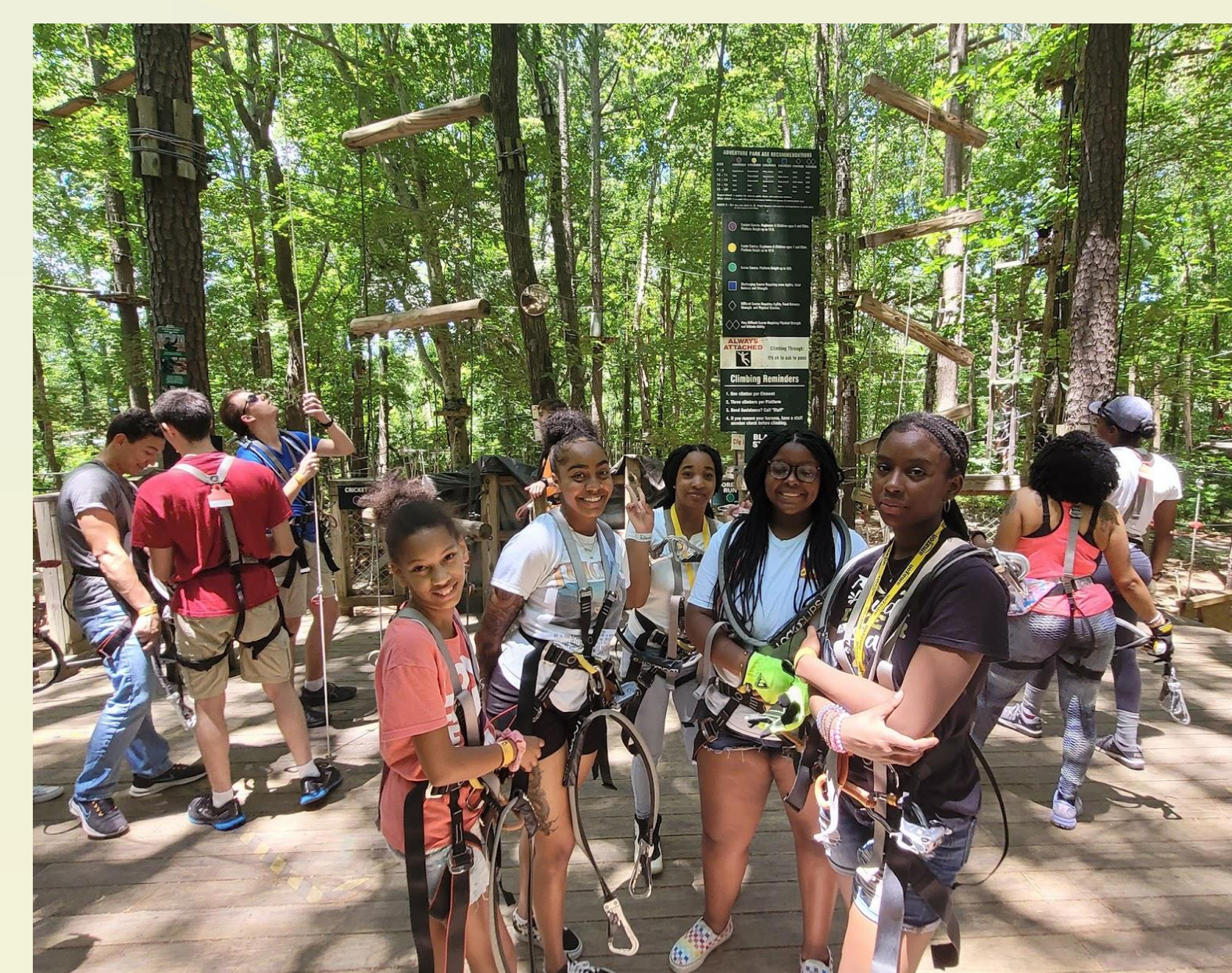
ECSU has integrated CERT and STEM classes, in projects such as the IMMERSE summer school funded by Burroughs Wellcome for a 3 year summer school mixing STEM and disaster preparedness together.