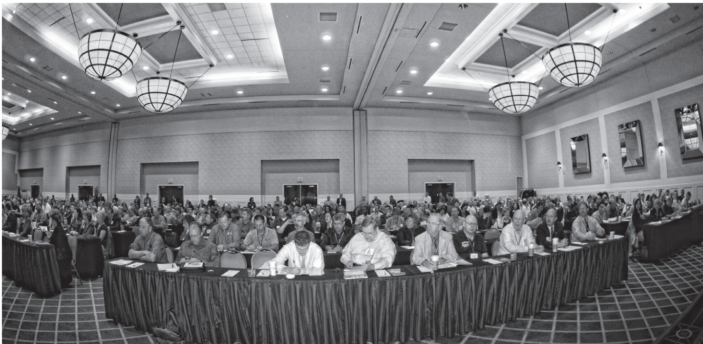
Opening General Session at IAEM 56th Annual Conference & EMEX 2008, held in Kansas City, Kansas, USA.

regional president or designee attendance at state conferences.