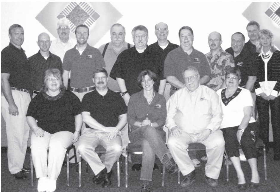
IAEM-USA Board members are pictured at their annual board retreat in Phoenix, Arizona.