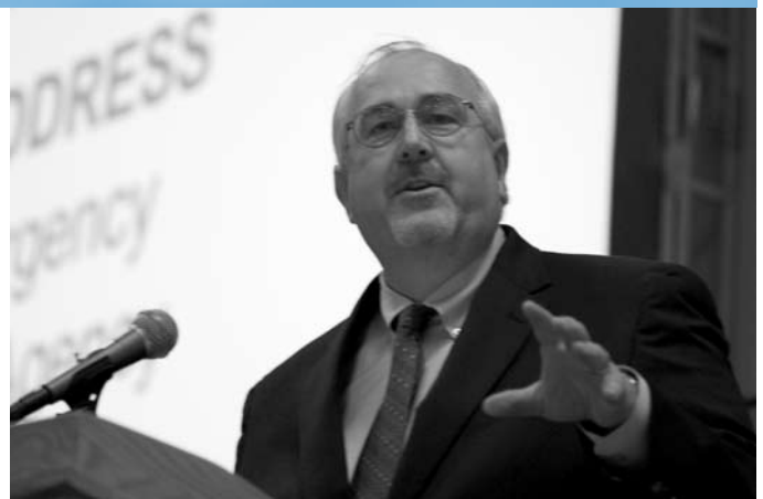
FEMA Administrator Craig Fugate was keynote speaker at the IAEM 2009 Annual Conference.

IAEM 2009 attracted more than 2,000 emergency management professionals, a record for the association. EMEX 2009 featured a record 230 booths with close to 50,000 square feet of exhibit space.