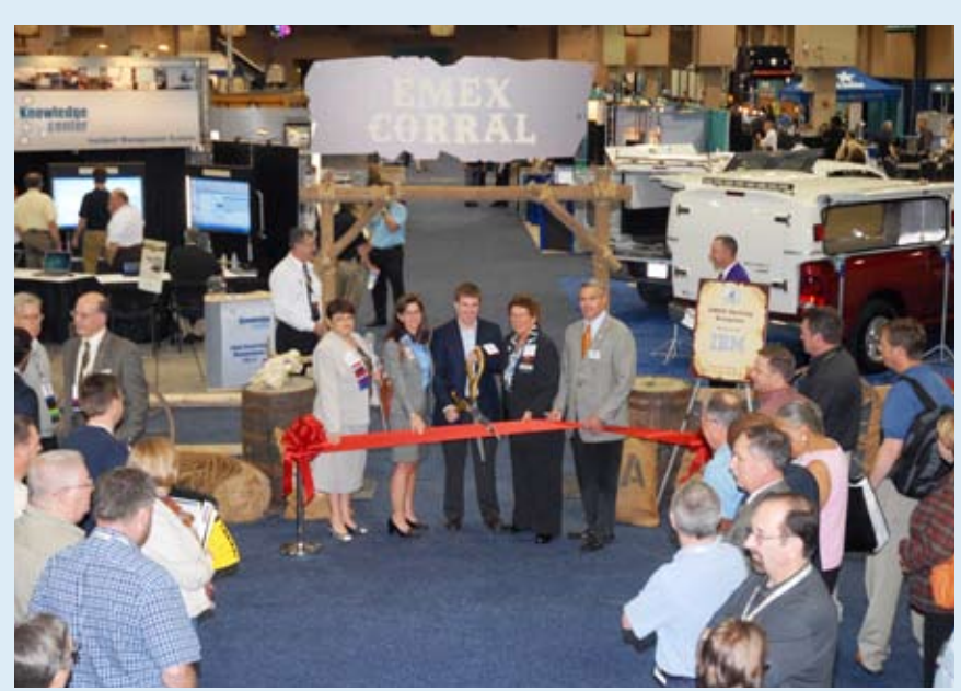
Ribbon-Cutting Ceremony Opens EMEX 2010. The Emergency Management & Homeland Security Expo brings together disaster officials and those who provide tools and resources. Products and services were featured from almost 200 suppliers at EMEX 2010 in San Antonio, Texas.