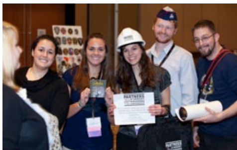
Scene from the 2011 IAEM Scholarship Auction.