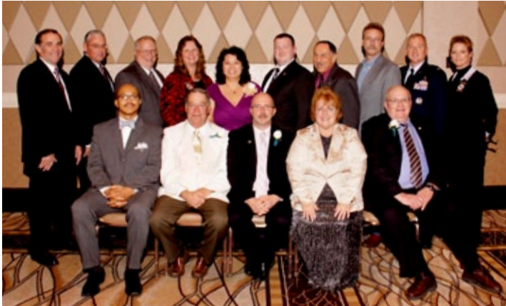
The IAEM-USA Board of Directors at the Presidential Banquet, IAEM-USA 59th Annual Conference & EMEX 2011, which drew more than 2,500 participants to Clark County, Nevada.