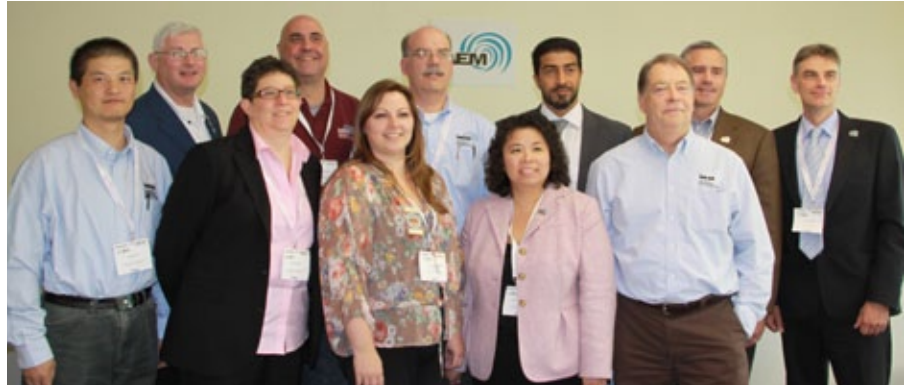
The IAEM-Global Board met on Oct. 11, 2011, at the EMEC 2011/IAEM-Global Annual Conference, held Oct. 11-13, 2011, in conjunction with inter airport Europe 2011 in Munich, Germany.