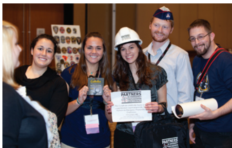
Scene from the 2011 IAEM Scholarship Auction.