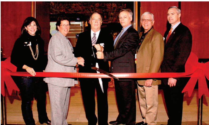
Official opening of the 2012 EMEX Expo.