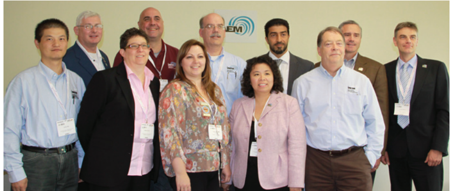
The IAEM-Global Board met on Oct. 11, 2011, at the EMEC 2011/IAEM-Global Annual Conference, held Oct. 11-13, 2011, in conjunction with inter airport Europe 2011 in Munich, Germany.