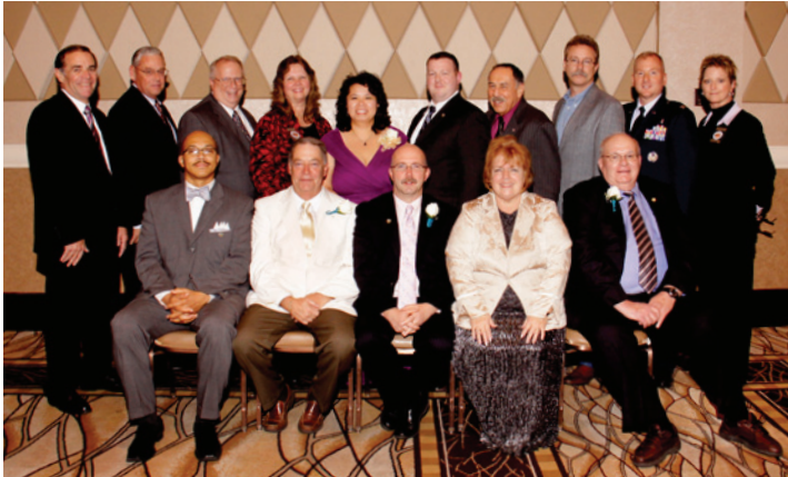
The IAEM-USA Board of Directors at the Presidential Banquet, IAEM-USA 59th Annual Conference & EMEX 2011, which drew more than 2,500 participants to Clark County, Nevada.