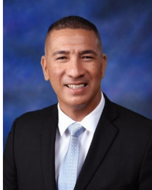
Emergency Management Administrator Maui Emergency Management Agency (MEMA)