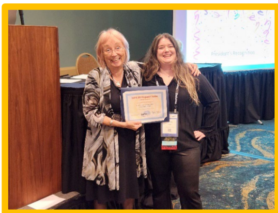
UEMA – I did not do a good job of connecting names with these pictures. I think she was a student from BYU (?)