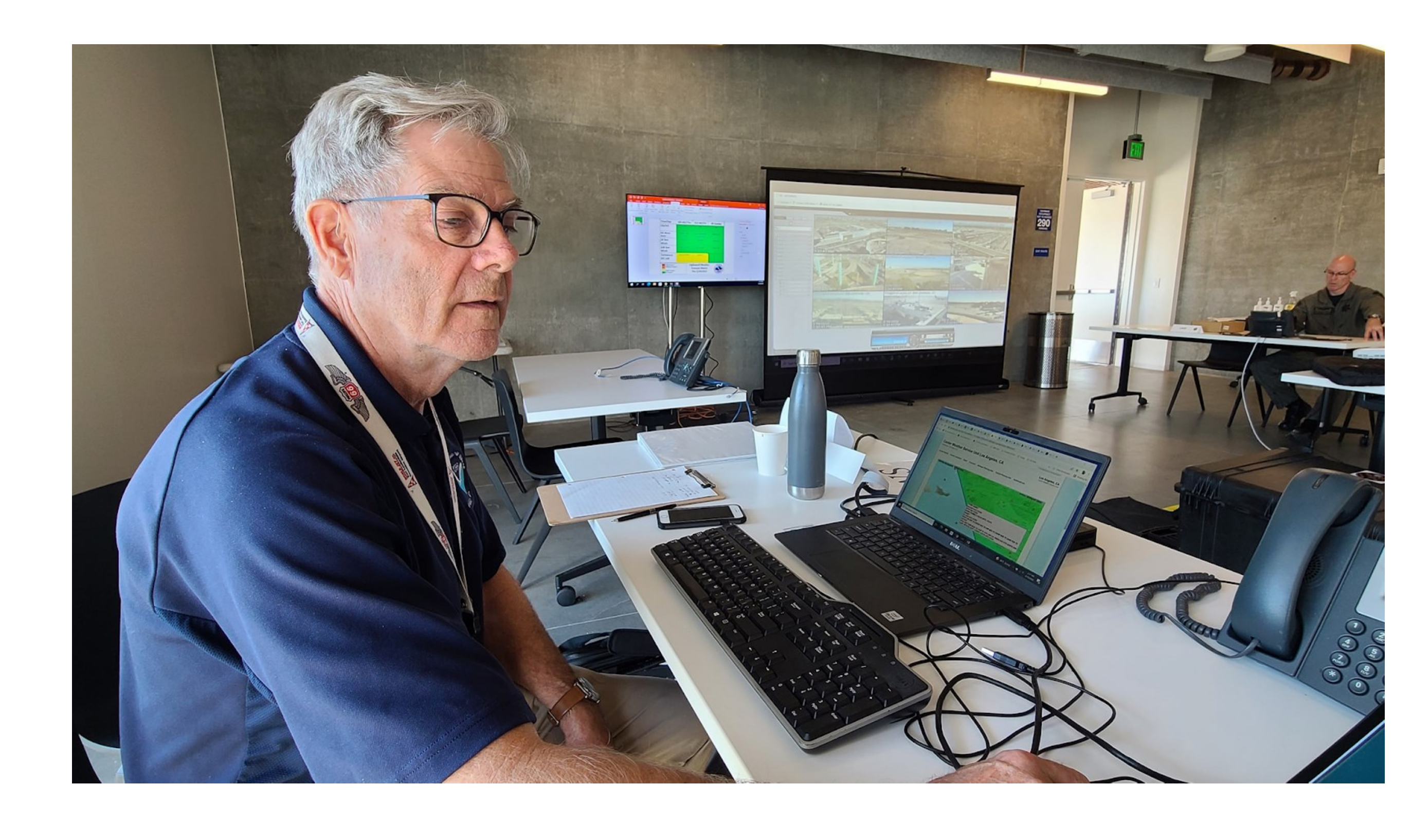
It is important to include NWS in planning process. This ensures the NWS can speak to support capabilities for each area of the event and in turn plan for what the support will look like.