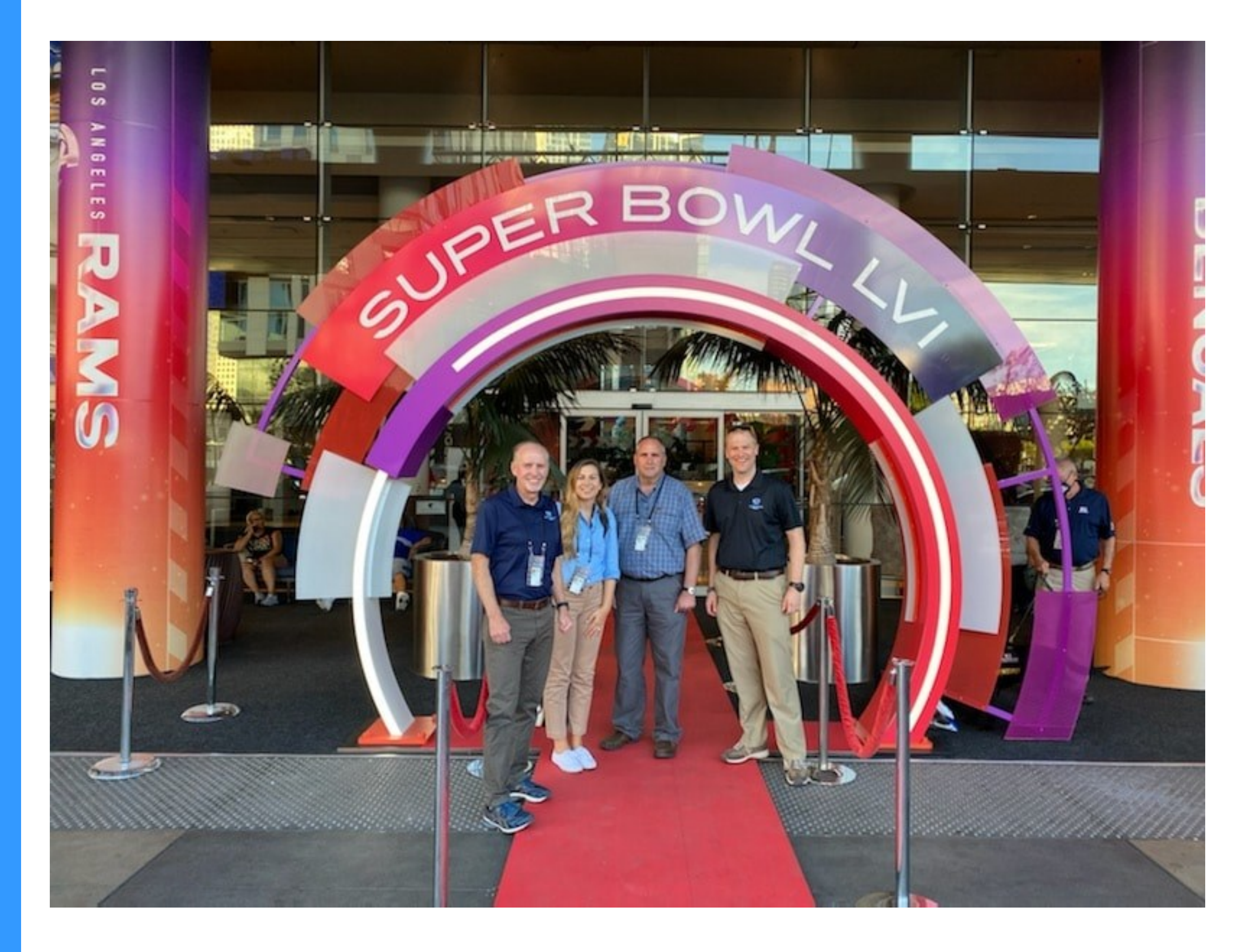
Perception of onsite support being a burden to the NWS is not the case