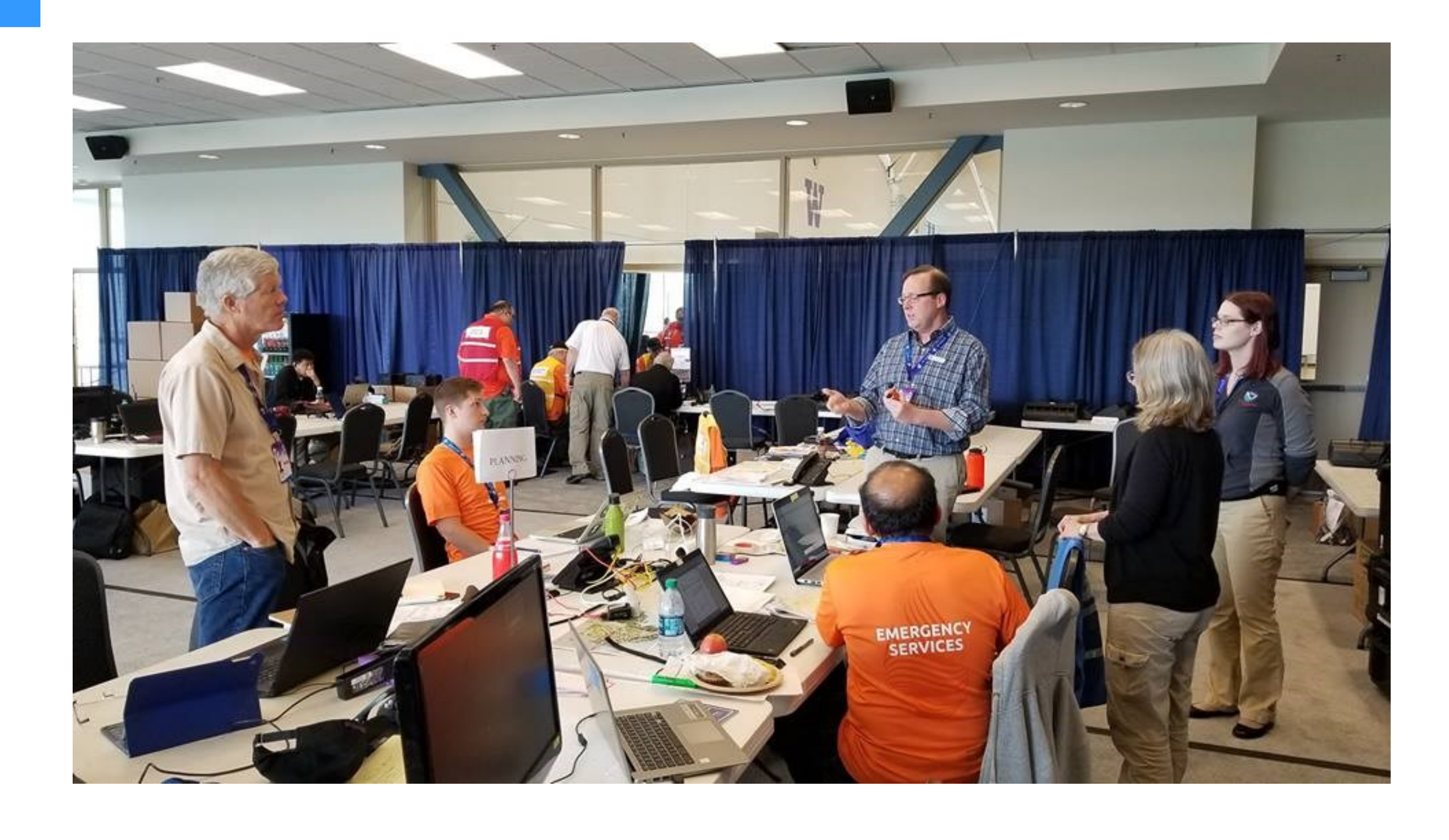
When only support option is virtual due to virtual EOC activations or space restrictions, NWS strives for a dedicated resource to support these activations